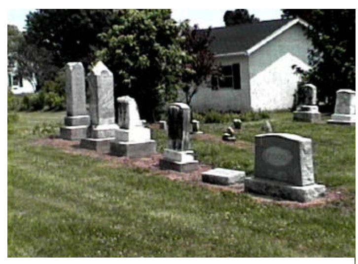
Flood burial site at the Christianburg Cemetery, Shelby County, Kentucky